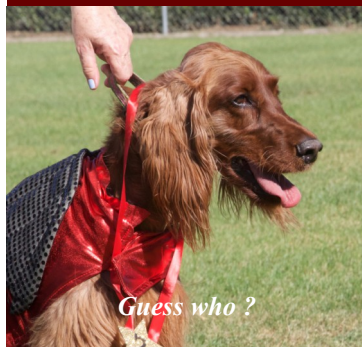
Guess who ?